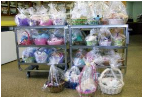
48 baskets ready for the Clothes Closet